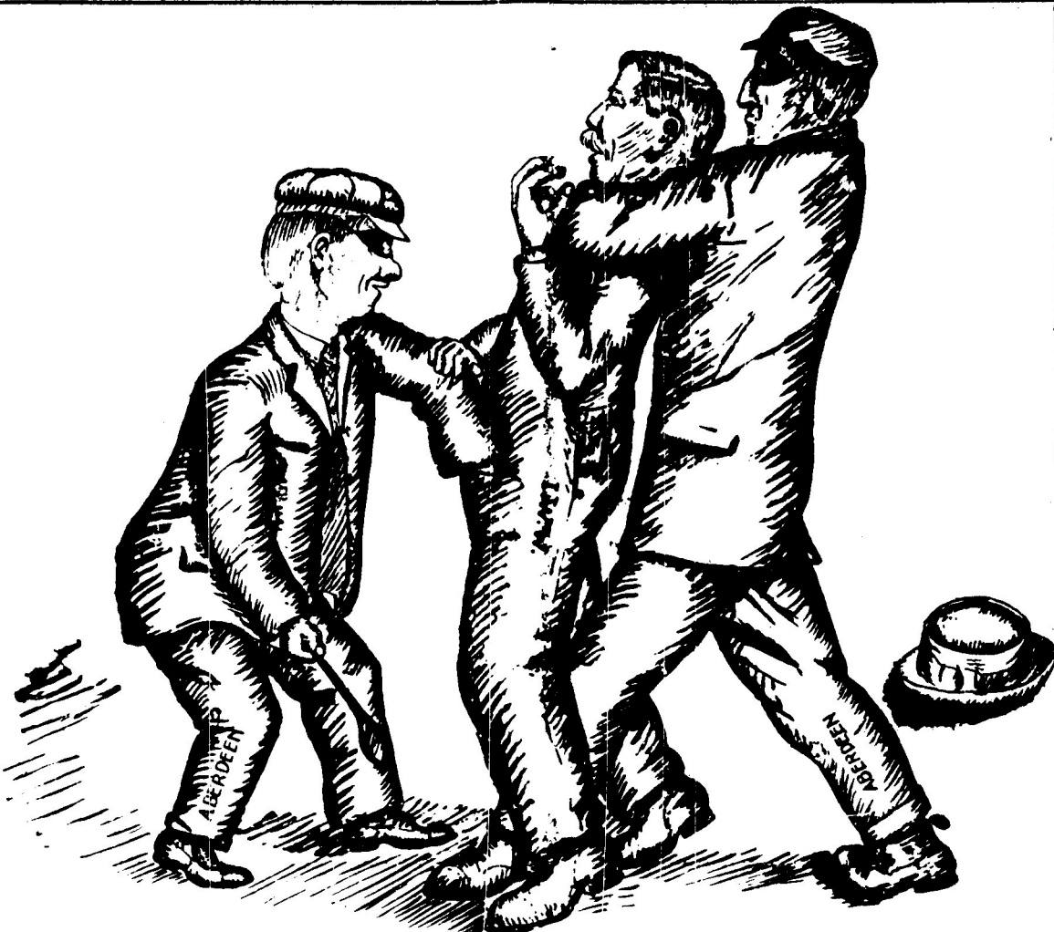
HOW THE SACRED CONSTITUTION IS UPHELD IN ABERDEEN

Every great moral teacher in history has been a heretic.